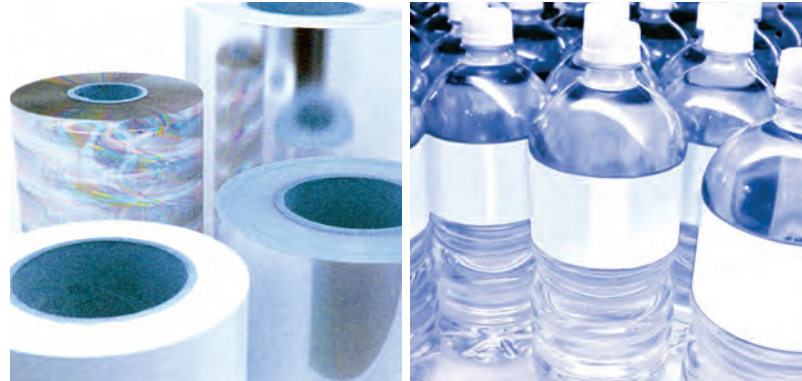
FilmLink 3000 improves films for labels and packaging by making them lighter weight and more white.