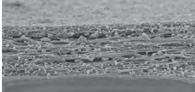
Cross-section of stretched film containing FilmLink additive. FilmLink increases impact and tear strength in breathable film.

ENVIRONMENTAL POLICY Imerys is committed to being a good neighbor to our environment and we take this responsibility very seriously. We have adopted the principles of Sustainable Development, which includes extensive training programs and considerable investment in environmental performance improvement.